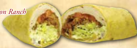
Turkey Bacon Ranch

Turkey Bacon Ranch .....$7 Oven-roasted turkey, bacon, lettuce, tomato, onions & ranch