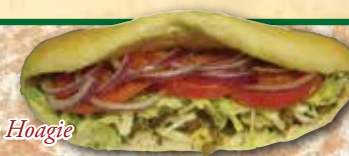
Cheese Steak Hoagie

The FDA advises consuming raw or undercooked meats, poultry, seafood or eggs increases your risk of foodborne illness.